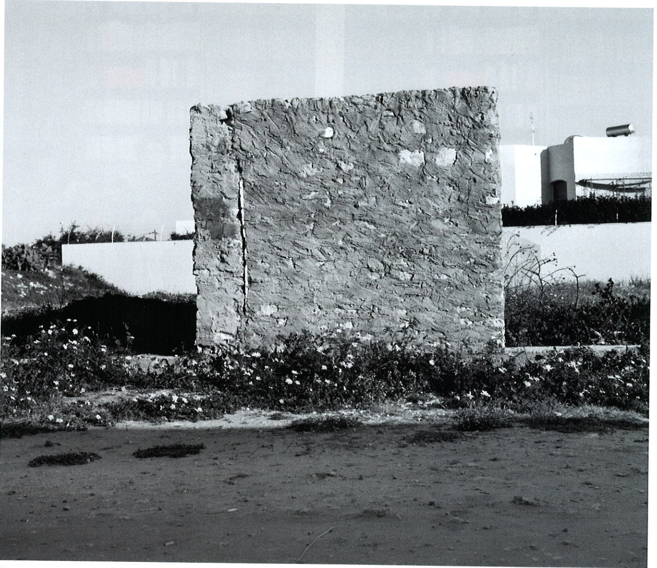
Mouna Karray - Murmurer #26, Murmurer series, 2009, Gelatine silver print, édition of 5, 100x100 cm

The four artists mentioned in this article share their Tunisian origin, but they all have their own artistic creation which is not related to a particular geographical context or a precise origin. Their language reflects their aspirations while maintaining a rule accessible to every human being regardless of their history and origin. The view of artists in general should remind us that it is dangerous to lock oneself in a unique pattern and established truths.